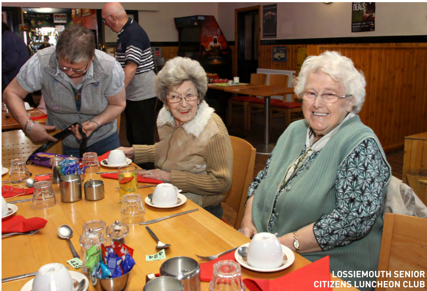
LOSSIEMOUTH SENIOR CITIZENS LUNCHEON CLUB