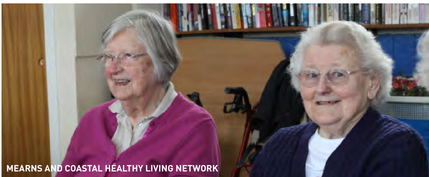
MEARNS AND COASTAL HEALTHY LIVING NETWORK

The centre is currently exploring possibilities for new premises. Key to their requirements is the space to upgrade and expand their café facility. The centre is also starting to explore the possibility of working towards the healthy living award.