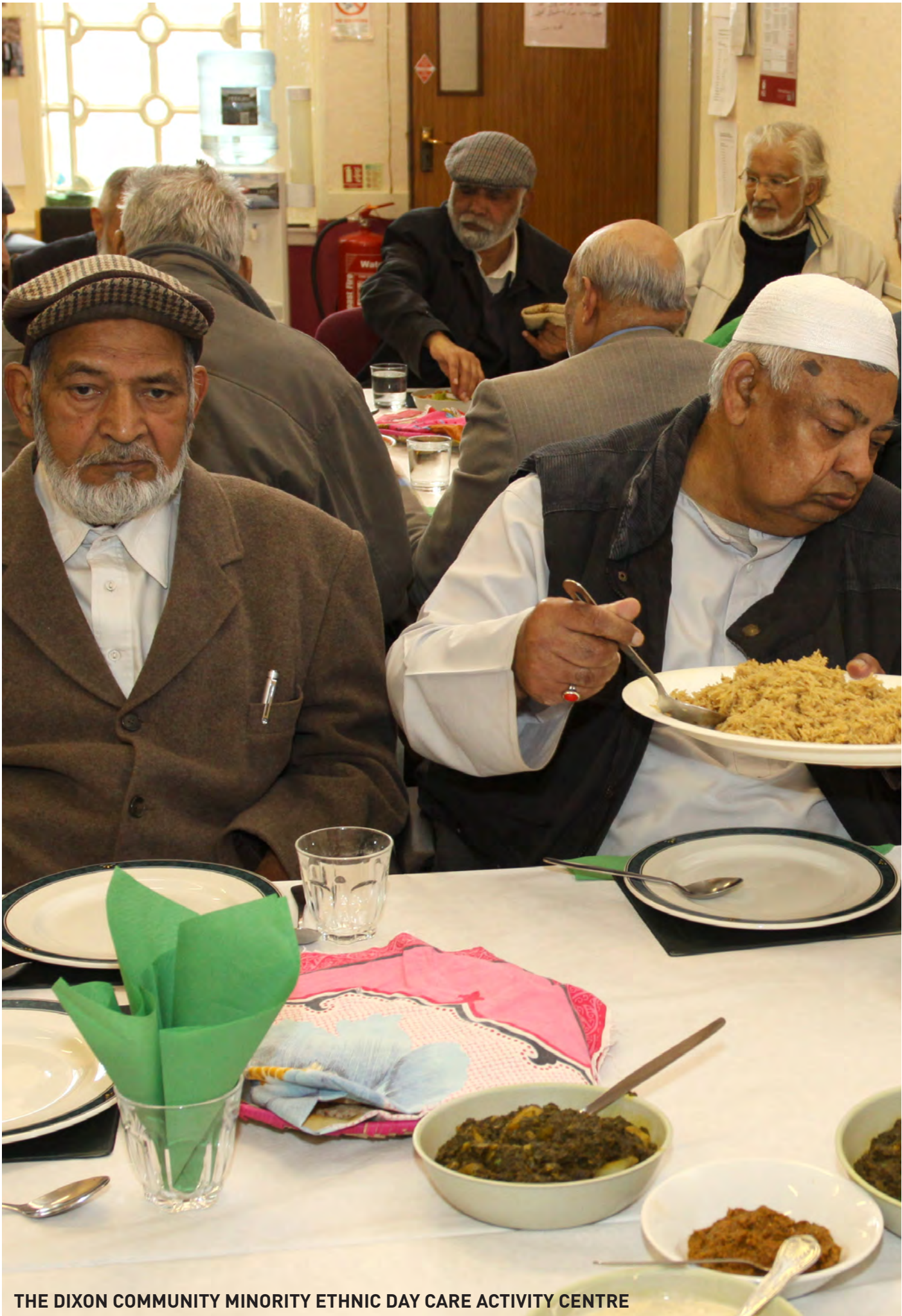
THE DIXON COMMUNITY MINORITY ETHNIC DAY CARE ACTIVITY CENTRE